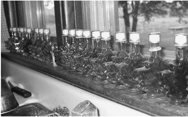
Rows of maple syrup bottles, each containing a sample of a particular batch of maple syrup collected last spring by Carl Hoffelder from DeKalb county.