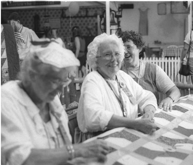
State Fair Masters, The Piecemakers, quilt together annually at the Indiana State Fair Pioneer Village.