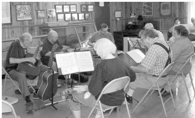
Community musicians playing in the Waterloo Depot Jam Session.